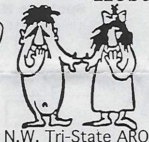
N.W. Tri-State ARO